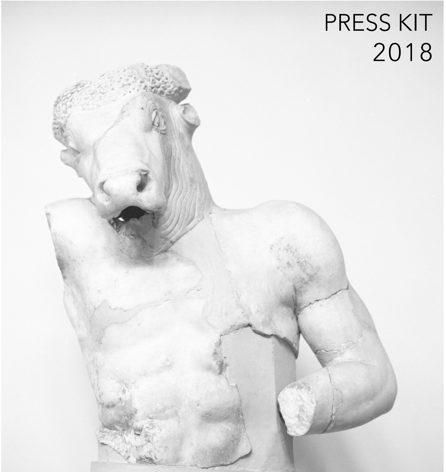
Sophie Knittel The fall of Attica